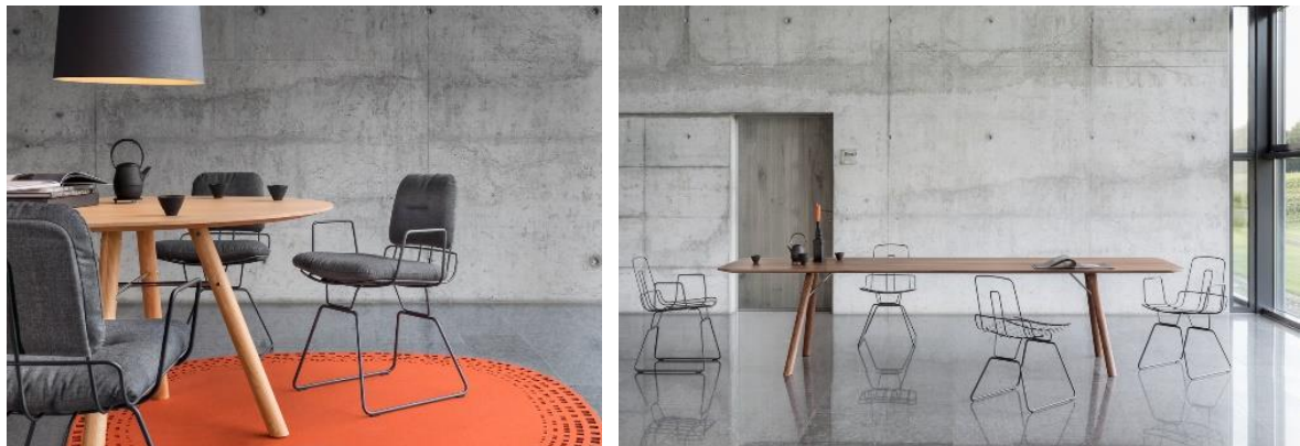
"Alambre" in combination with the "Akio" table in oak (left) and in walnut (right)

For more detailed information about the company visit www.girsberger.com .