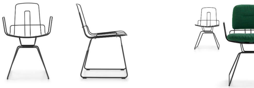
"Alambre" is available with or without armrests and with or without seat and back cushions

These and other pictures can be downloaded from Girsberger's image database in both Internet quality and high resolution.