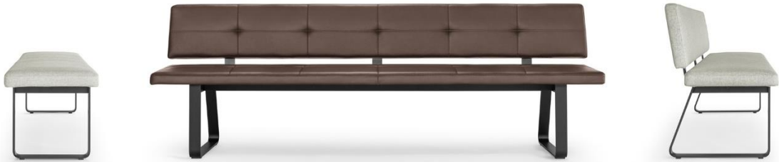
"Carim" with a sleigh-leg frame

The " Linar " solid wood table features a four-legged flat steel structure which gives it a slender and sophisticated look. Yet the frame boasts excellent stability, enabling tables to be up to 4 metres in length. The edges of the solid wood tabletop are bevelled, further emphasizing the table's sophisticated character. "Linar" is available in all types of wood and surface finishes in the Girsberger solid wood collection.