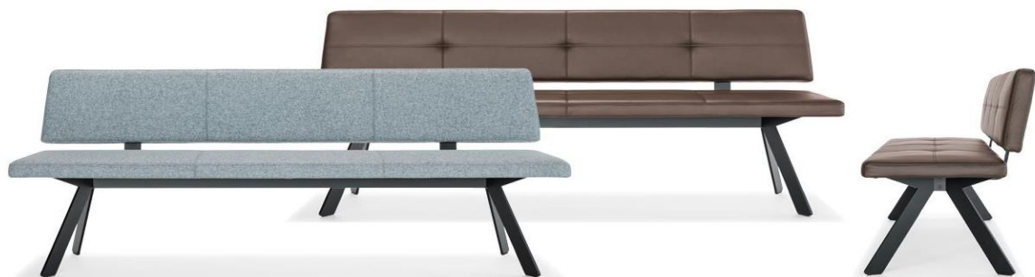
"Carim" with an A-frame

" Carim " is a straight-lined and elegant bench that comes with the choice of an A-frame or sleigh-leg frame. It is available with or without a backrest and in four lengths: 180 cm, 220 cm, 240 cm and 280 cm. The A-frame version of " Carim " goes perfectly with the Barra table. The sleigh-leg version can be combined with a wide variety of different tables. As well as the standard upholstery option, a version with button tufting is also offered, which gives the bench a luxurious and classic character. Design: Atelier I+N/Ismaël and Nathan Studer