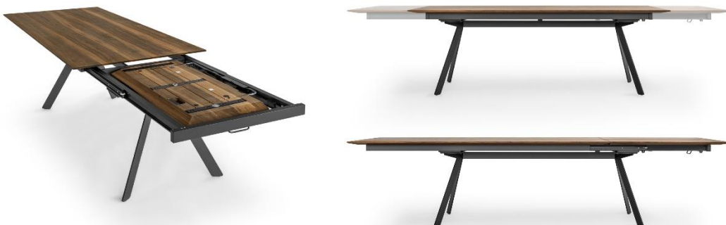
"Barra" – now available as an extendable table

Design: Atelier I+N/Ismaël and Nathan Studer