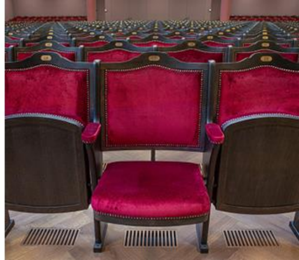
The final design of the folding seat

In the Hans Huber Hall, which is also listed and is used as a venue for chamber music, Girsberger repaired and relacquered the folding seats in the gallery, which incorporate woven rattan.