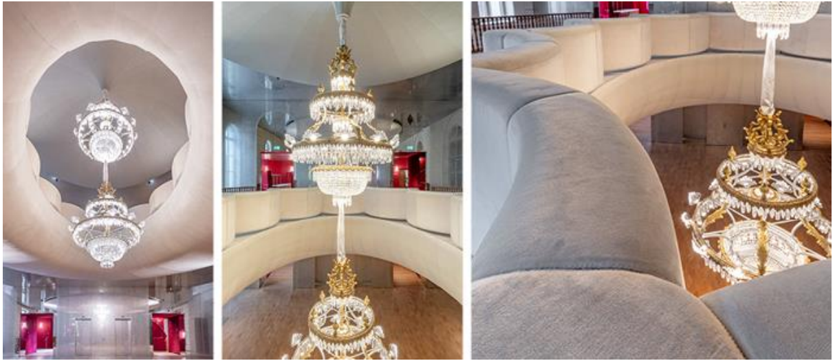
Looking up from the ground floor, the canopy appears weightless, yet it conceals a balustrade on the upper floor. The upholstered and fabric-covered structure was also made by Girsberger Customized Furniture.