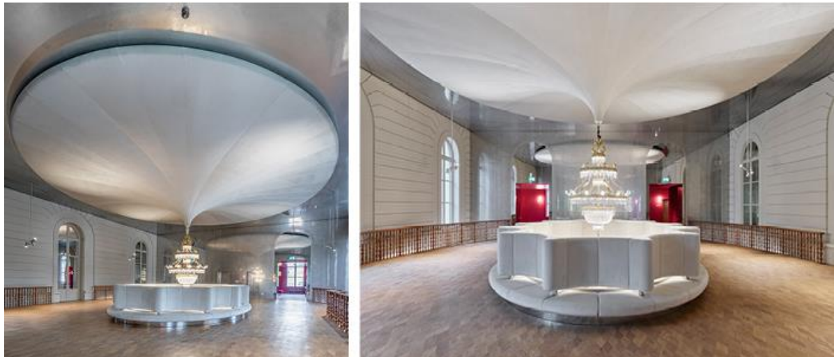
In the foyer on the upper floor: The central bench with canopy also forms the opening for the two-storey high crystal chandelier, which hangs all the way down to the ground floor.