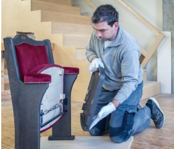
Creating a prototype based on old photos

Using various prototypes, sitting comfort, folding mechanism, materials, colours and dimensions were agreed with the architects, and various acoustic set-ups were tested in the laboratory. The seating is made from solid oak (stained smoked oak), along with certified fire-retardant upholstery foam and velour fabric. A pneumatic stop damper keeps the folding mechanism quiet.