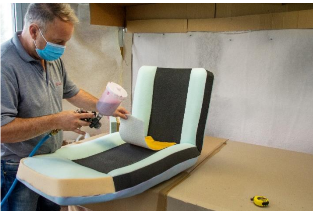
Integrating the seat heating element