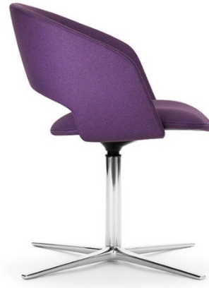
Side view of "Comfort" version with backrest extended towards the rear opening