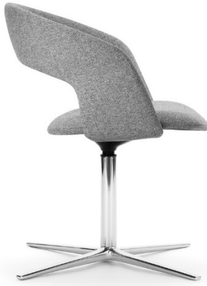
Side view with narrow backrest