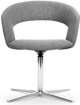
Calina with narrow backrest

The option with a height-adjustable five-star base on castors makes Calina an attractive swivel chair for temporary work or as an appealing office chair when working from home.