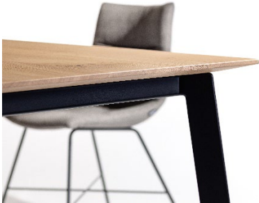
The close fit of the extension function means that it is not visible within the frame. The bevelled edge gives the tabletop (here oak) a slimline look.