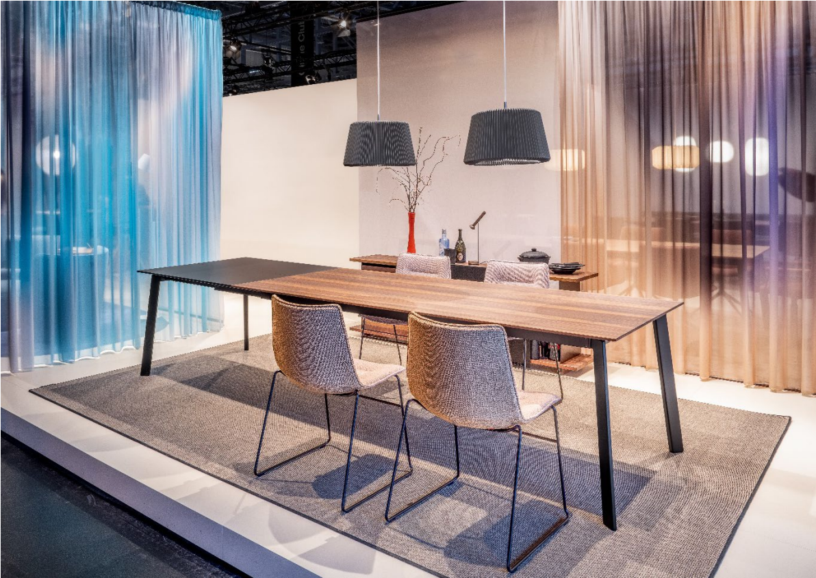
Liola table – with black MDF extension