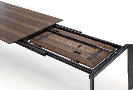
Retracted solid wood extension, American walnut table